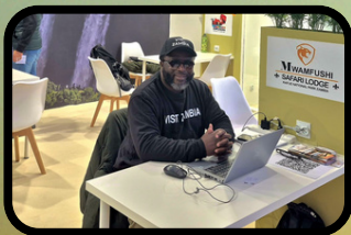
Our Director at the ITB in Berlin