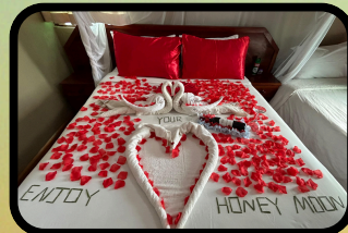
Many couples celebrated their honeymoon at the camp