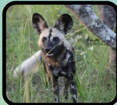
African Wild dog