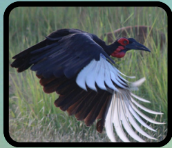
Southern ground hornbill